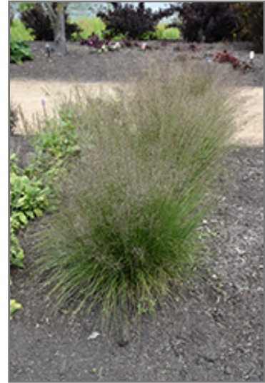
Gone With The Wind Prairie Dropseed

Gone With The Wind Prairie Dropseed is recommended for the following landscape applications;