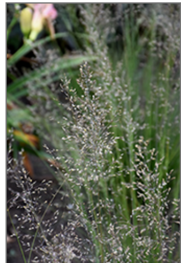
Gone With The Wind Prairie Dropseed flowers