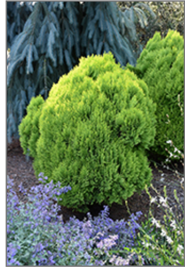
Morgan Oriental Arborvitae