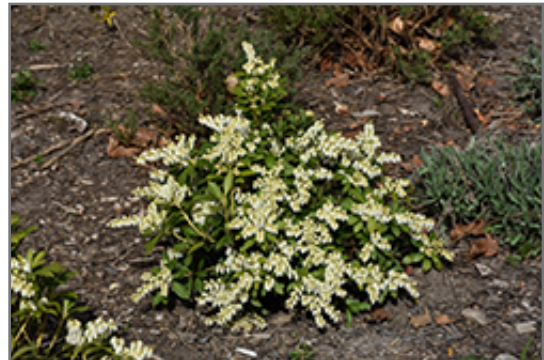
Cavatine Dwarf Japanese Pieris in bloom