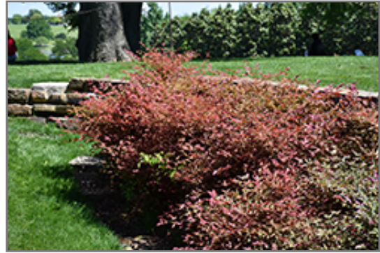
Flirt Nandina

Flirt Nandina is recommended for the following landscape applications;