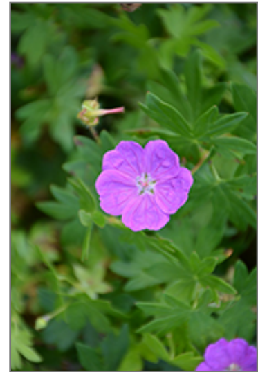
New Hampshire Purple Cranesbill flowers

New Hampshire Purple Cranesbill will grow to be about 18 inches tall at maturity, with a spread of 3 feet. When grown in masses or used as a bedding plant, individual plants should be spaced approximately 30 inches apart. Its foliage tends to remain dense right to the ground, not requiring facer plants in front. It grows at a medium rate, and under ideal conditions can be expected to live for approximately 10 years. As an herbaceous perennial, this plant will usually die back to the crown each winter, and will regrow from the base each spring. Be careful not to disturb the crown in late winter when it may not be readily seen!