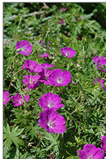
New Hampshire Purple Cranesbill flowers

This is a relatively low maintenance plant, and should only be pruned after flowering to avoid removing any of the current season's flowers. Deer don't particularly care for this plant and will usually leave it alone in favor of tastier treats. It has no significant negative characteristics.