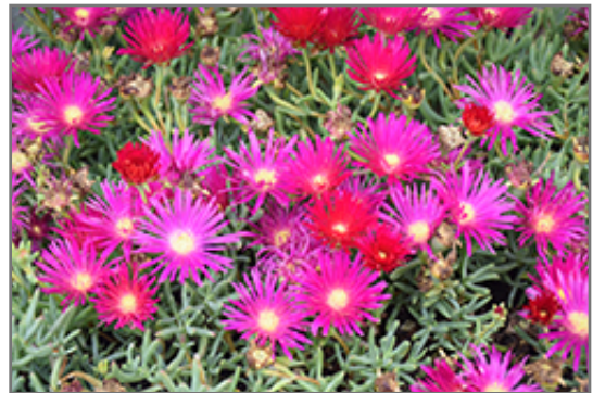
Purple Ice Plant flowers