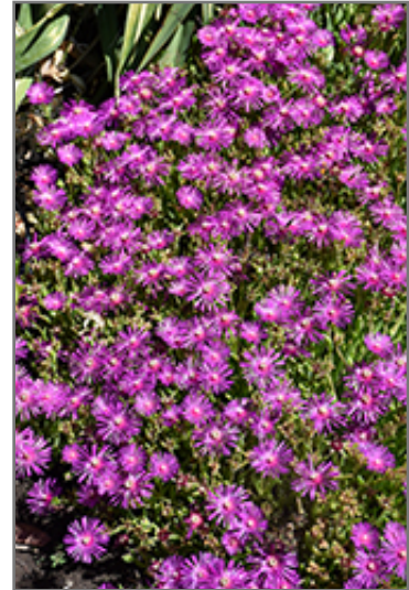
Purple Ice Plant flowers

Purple Ice Plant is recommended for the following landscape applications;