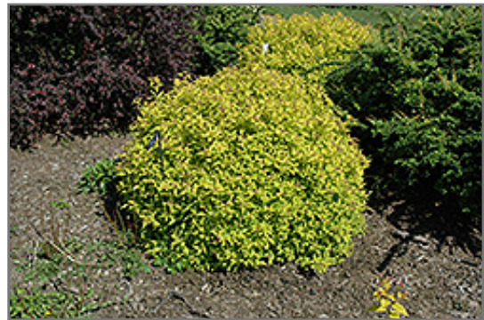
Lemon Princess Spirea