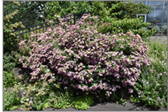
Lemon Princess Spirea in bloom

Lemon Princess Spirea will grow to be about 24 inches tall at maturity, with a spread of 3 feet. It tends to fill out right to the ground and therefore doesn't necessarily require facer plants in front. It grows at a fast rate, and under ideal conditions can be expected to live for approximately 20 years.