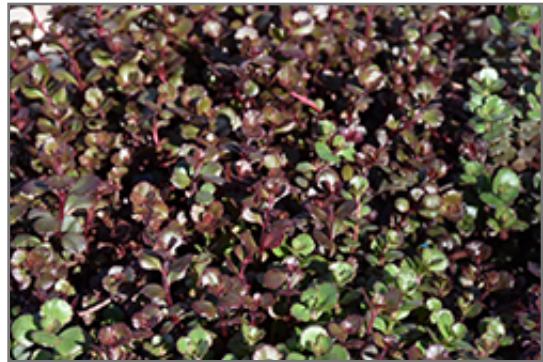
Bronze Carpet Stonecrop