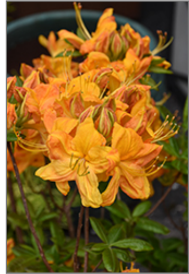
Klondyke Azalea flowers