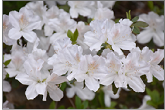
Delaware Valley White Azalea flowers