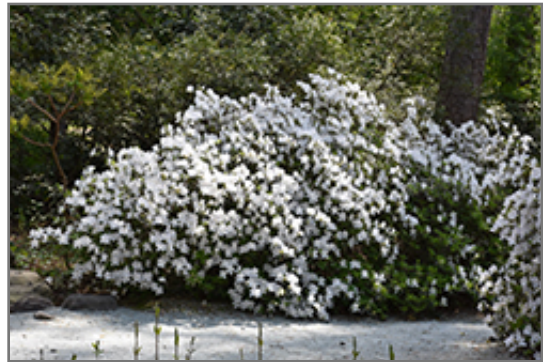
Delaware Valley White Azalea in bloom