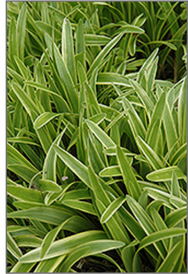
Variegata Lily Turf foliage

This plant does best in partial shade to shade. It does best in average to evenly moist conditions, but will not tolerate standing water. It is not particular as to soil type or pH. It is somewhat tolerant of urban pollution. This is a selected variety of a species not originally from North America. It can be propagated by division; however, as a cultivated variety, be aware that it may be subject to certain restrictions or prohibitions on propagation.