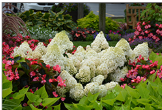
Little Lime Hydrangea flowers