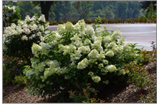
Little Lime Hydrangea in bloom

This shrub performs well in both full sun and full shade. It prefers to grow in average to moist conditions, and shouldn't be allowed to dry out. It is not particular as to soil type or pH. It is highly tolerant of urban pollution and will even thrive in inner city environments. Consider applying a thick mulch around the root zone in winter to protect it in exposed locations or colder microclimates. This is a selected variety of a species not originally from North America.