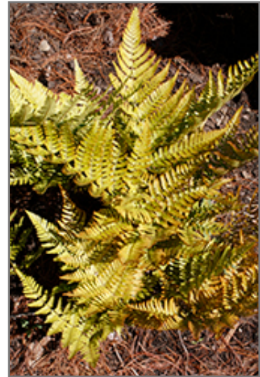
Brilliance Autumn Fern in fall