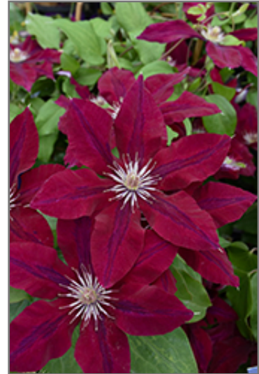
Rebecca Clematis flowers

Rebecca Clematis is recommended for the following landscape applications;