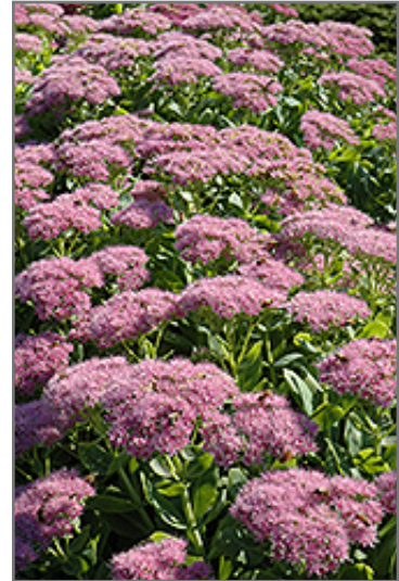
Brilliant Stonecrop flowers

Brilliant Stonecrop is recommended for the following landscape applications;