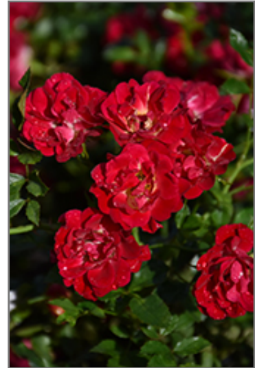
Red Drift Rose flowers

Red Drift Rose makes a fine choice for the outdoor landscape, but it is also well-suited for use in outdoor pots and containers. Because of its spreading habit of growth, it is ideally suited for use as a 'spiller' in the 'spiller-thriller-filler' container combination; plant it near the edges where it can spill gracefully over the pot. Note that when grown in a container, it may not perform exactly as indicated on the tag - this is to be expected. Also note that when growing plants in outdoor containers and baskets, they may require more frequent waterings than they would in the yard or garden.