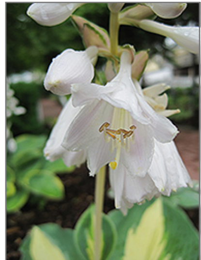
Dream Weaver Hosta flowers