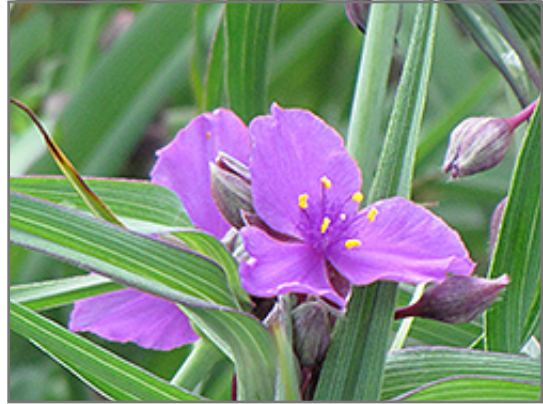
Concord Grape Spiderwort flowers

This plant performs well in both full sun and full shade. It requires an evenly moist well-drained soil for optimal growth. It is not particular as to soil type or pH. It is highly tolerant of urban pollution and will even thrive in inner city environments. Consider applying a thick mulch around the root zone in winter to protect it in exposed locations or colder microclimates. This particular variety is an interspecific hybrid. It can be propagated by division; however, as a cultivated variety, be aware that it may be subject to certain restrictions or prohibitions on propagation.