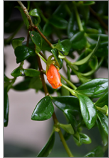
Goldfish Plant flowers

This is a dense herbaceous evergreen houseplant with a trailing habit of growth, eventually spilling over the edges of hanging baskets and containers. This plant can be pruned at any time to keep it looking its best.