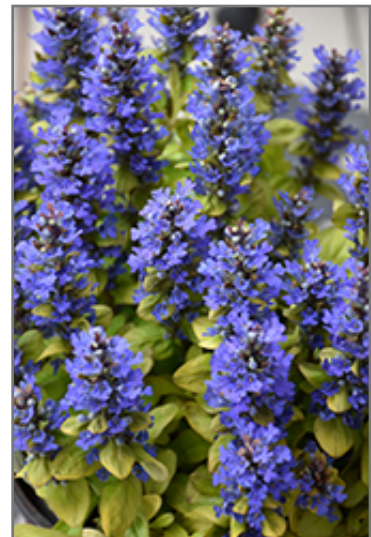
Feathered Friends Petite Parakeet Bugleweed flowers