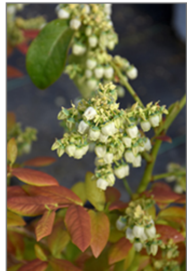
Sky Dew Gold Ornamental Blueberry flowers