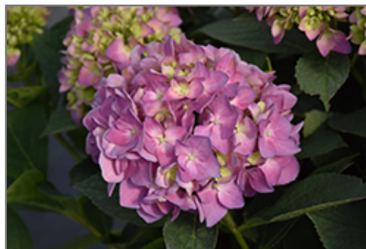
Let's Dance Sky View Hydrangea flowers