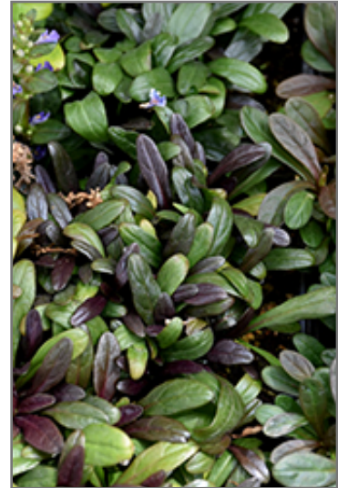
Feathered Friends Noble Nightingale Bugleweed foliage