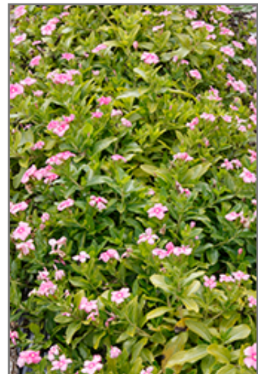
Cora Cascade Shell Pink Vinca in bloom