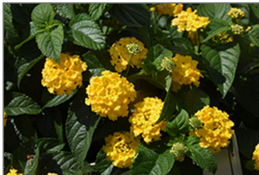
Lucky Yellow Lantana flowers