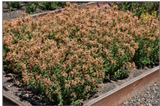
Kudos Gold Hyssop in bloom