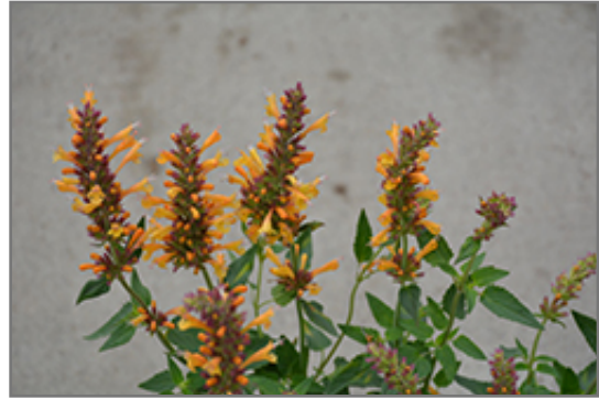
Kudos Gold Hyssop flowers