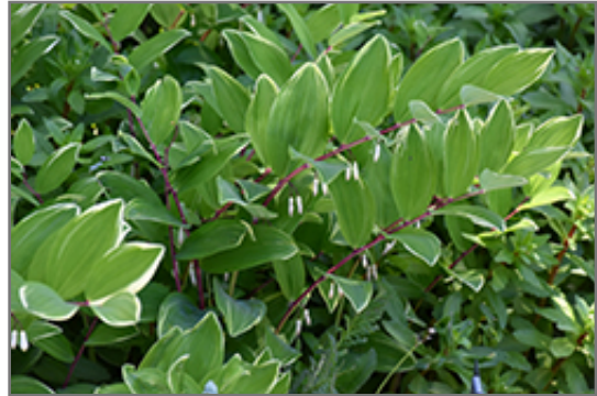
Variegated Solomon's Seal flowers