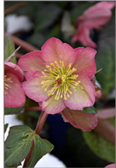
FrostKiss Cheryl's Shine Hellebore flowers

This is a relatively low maintenance plant, and should be cut back in late fall in preparation for winter. Deer don't particularly care for this plant and will usually leave it alone in favor of tastier treats. It has no significant negative characteristics.