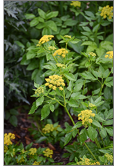
Golden Alexander flowers

Golden Alexander is recommended for the following landscape applications;