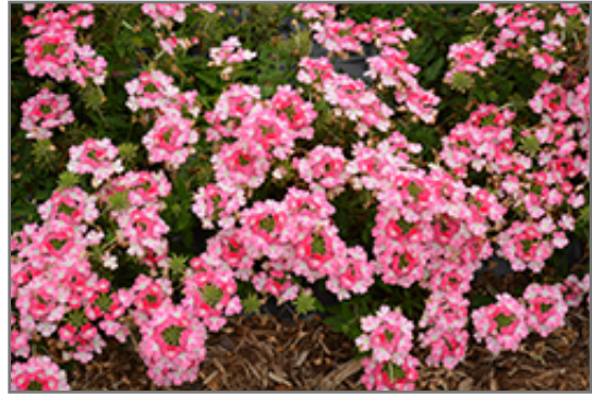
EnduraScape Pink Fizz Verbena flowers

EnduraScape Pink Fizz Verbena will grow to be about 12 inches tall at maturity, with a spread of 24 inches. When grown in masses or used as a bedding plant, individual plants should be spaced approximately 18 inches apart. Its foliage tends to remain dense right to the ground, not requiring facer plants in front. It grows at a fast rate, and under ideal conditions can be expected to live for approximately 3 years. As an herbaceous perennial, this plant will usually die back to the crown each winter, and will regrow from the base each spring. Be careful not to disturb the crown in late winter when it may not be readily seen!