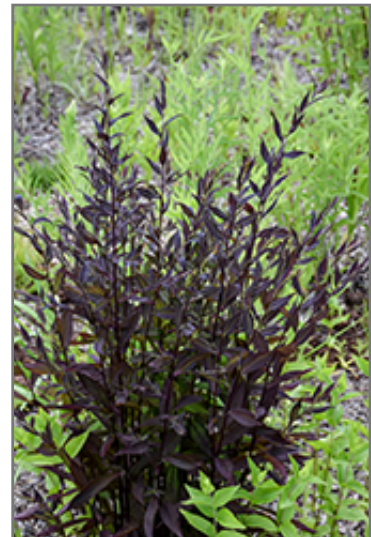
Lady In Black Calico Aster foliage