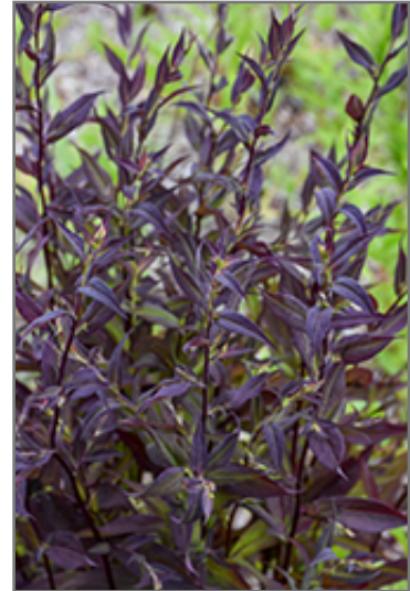
Lady In Black Calico Aster