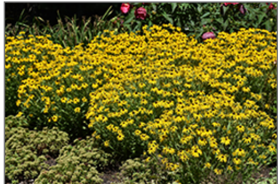
American Gold Rush Coneflower in bloom