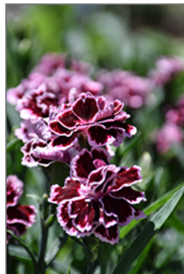
Odessa Pierrot Pinks flowers

Odessa Pierrot Pinks is recommended for the following landscape applications;