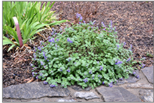
Early Bird Catmint in bloom

Early Bird Catmint will grow to be about 10 inches tall at maturity, with a spread of 12 inches. When grown in masses or used as a bedding plant, individual plants should be spaced approximately 10 inches apart. Its foliage tends to remain low and dense right to the ground. It grows at a fast rate, and under ideal conditions can be expected to live for approximately 10 years. As an herbaceous perennial, this plant will usually die back to the crown each winter, and will regrow from the base each spring. Be careful not to disturb the crown in late winter when it may not be readily seen!