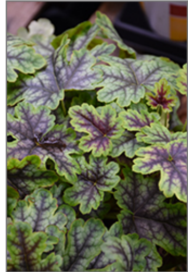
Tapestry Foamy Bells foliage

Tapestry Foamy Bells is recommended for the following landscape applications;