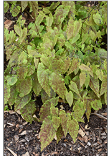
Amber Queen Barrenwort foliage