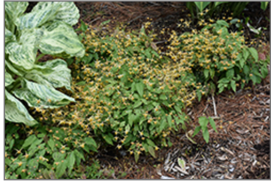
Amber Queen Barrenwort in bloom