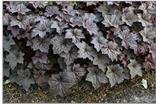
Palace Purple Coral Bells

Palace Purple Coral Bells will grow to be about 12 inches tall at maturity extending to 24 inches tall with the flowers, with a spread of 12 inches. When grown in masses or used as a bedding plant, individual plants should be spaced approximately 10 inches apart. Its foliage tends to remain dense right to the ground, not requiring facer plants in front. It grows at a medium rate, and under ideal conditions can be expected to live for approximately 10 years. As an evergreen perennial, this plant will typically keep its form and foliage year-round.