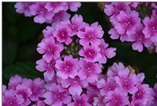
EnduraScape Pink Bicolor Verbena flowers

This plant will require occasional maintenance and upkeep. Trim off the flower heads after they fade and die to encourage more blooms late into the season. Deer don't particularly care for this plant and will usually leave it alone in favor of tastier treats. It has no significant negative characteristics.