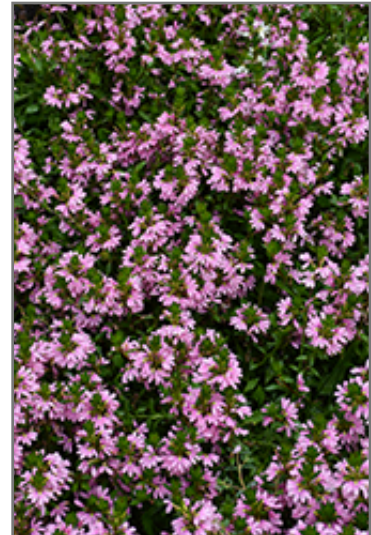
Whirlwind Pink Fan Flower flowers