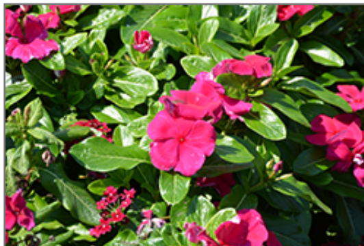
Cora Cascade Magenta Vinca flowers

Cora Cascade Magenta Vinca is recommended for the following landscape applications;