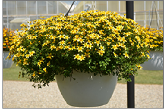
Beedance Yellow Bidens in bloom

Beedance Yellow Bidens will grow to be about 12 inches tall at maturity, with a spread of 18 inches. When grown in masses or used as a bedding plant, individual plants should be spaced approximately 12 inches apart. Its foliage tends to remain dense right to the ground, not requiring facer plants in front. Although it's not a true annual, this fast-growing plant can be expected to behave as an annual in our climate if left outdoors over the winter, usually needing replacement the following year. As such, gardeners should take into consideration that it will perform differently than it would in its native habitat.