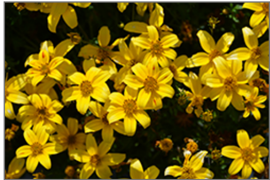
Beedance Yellow Bidens flowers