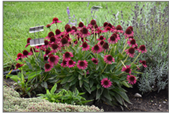
Delicious Candy Coneflower in bloom

Delicious Candy Coneflower will grow to be about 18 inches tall at maturity extending to 24 inches tall with the flowers, with a spread of 15 inches. It grows at a medium rate, and under ideal conditions can be expected to live for approximately 10 years. As an herbaceous perennial, this plant will usually die back to the crown each winter, and will regrow from the base each spring. Be careful not to disturb the crown in late winter when it may not be readily seen!