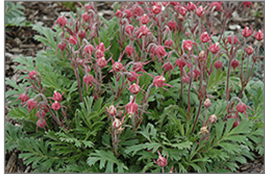
Prairie Smoke in bloom

This plant will require occasional maintenance and upkeep, and should be cut back in late fall in preparation for winter. It is a good choice for attracting butterflies to your yard, but is not particularly attractive to deer who tend to leave it alone in favor of tastier treats. Gardeners should be aware of the following characteristic(s) that may warrant special consideration;