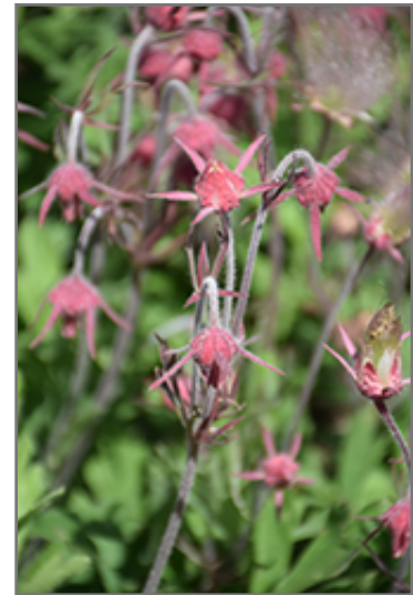
Prairie Smoke flower buds