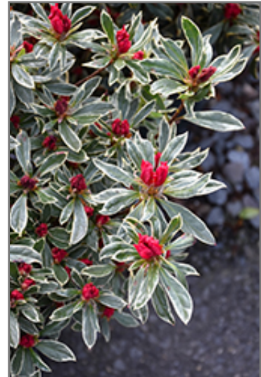
Silver Sword Azalea foliage