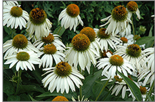
White Swan Coneflower flowers

White Swan Coneflower is recommended for the following landscape applications;