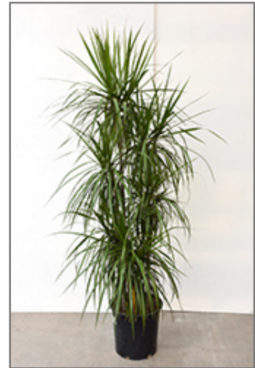
Red-edge Dracaena

When grown indoors, Red-edge Dracaena can be expected to grow to be about 8 feet tall at maturity, with a spread of 4 feet. It grows at a medium rate, and under ideal conditions can be expected to live for approximately 10 years. This houseplant performs well in both bright or indirect sunlight and strong artificial light, and can therefore be situated in almost any well-lit room or location. It does best in average to evenly moist soil, but will not tolerate standing water. The surface of the soil shouldn't be allowed to dry out completely, and so you should expect to water this plant once and possibly even twice each week. Be aware that your particular watering schedule may vary depending on its location in the room, the pot size, plant size and other conditions; if in doubt, ask one of our experts in the store for advice. It is not particular as to soil type or pH; an average potting soil should work just fine.