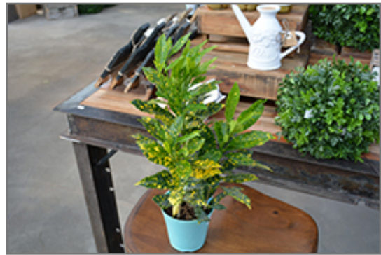
Gold Dust Variegated Croton