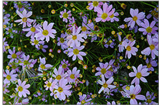
Pink Tickseed flowers