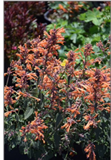
Kudos Mandarin Hyssop flowers