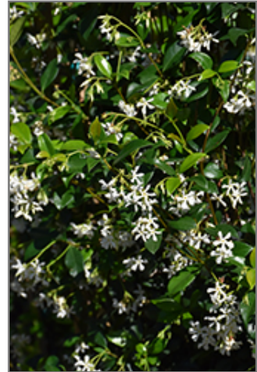
Madison Star-Jasmine flowers

Madison Star-Jasmine makes a fine choice for the outdoor landscape, but it is also well-suited for use in outdoor pots and containers. Because of its spreading habit of growth, it is ideally suited for use as a 'spiller' in the 'spiller-thriller-filler' container combination; plant it near the edges where it can spill gracefully over the pot. It is even sizeable enough that it can be grown alone in a suitable container. Note that when grown in a container, it may not perform exactly as indicated on the tag - this is to be expected. Also note that when growing plants in outdoor containers and baskets, they may require more frequent waterings than they would in the yard or garden.