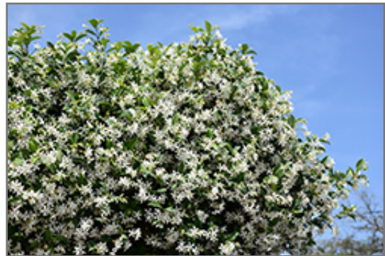
Madison Star-Jasmine flowers